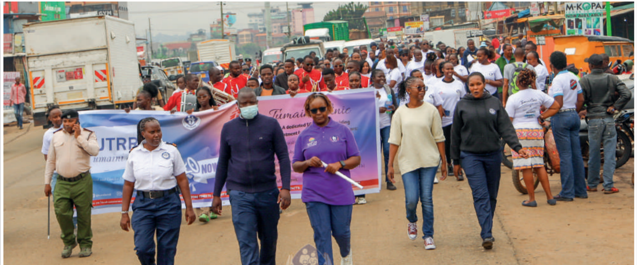
KUTRRH staff during a walk to the Kahawa West round about during the official launch of the Tumaini Sexual Gender Based Violence (SGBV) Clinic at the Hospital. This Clinic provides free, round-the-clock, comprehensive medical, legal, and psychological services to survivors.